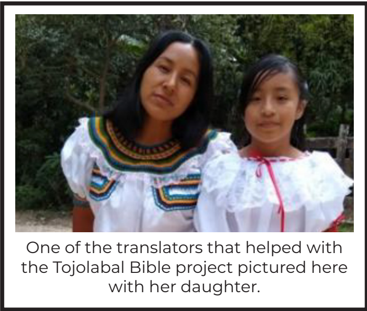
One of the translators that helped with the Tojolabal Bible project pictured here with her daughter.