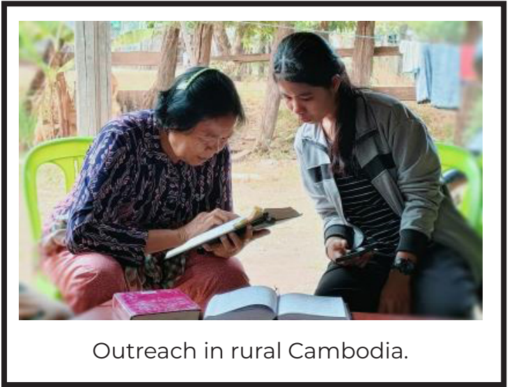
Outreach in rural Cambodia.