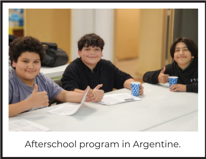
Afterschool program in Argentine.