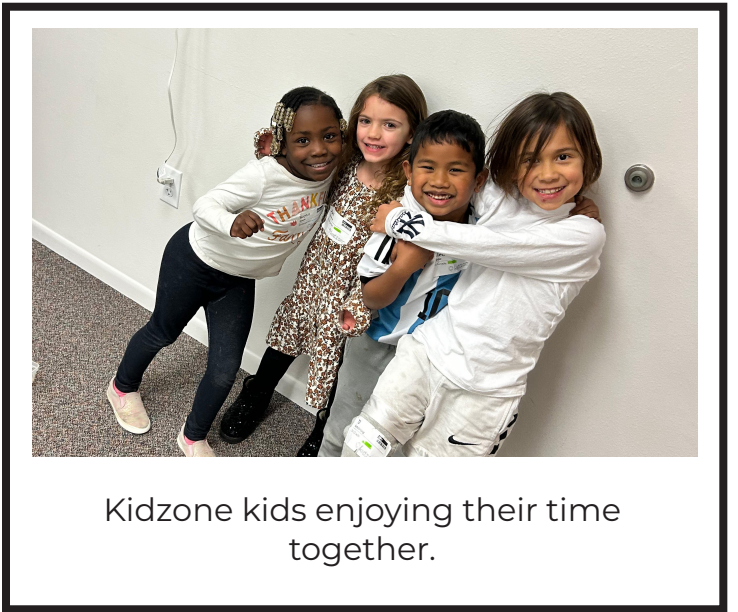
Kidzone kids enjoying their time together.