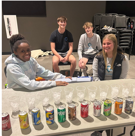
We celebrate the many people who participated in the Centerpoint Students Trivia Night Fundraiser! Thank you to all who came to raise money to send kids on ministry trips and to all who helped make the night a success!